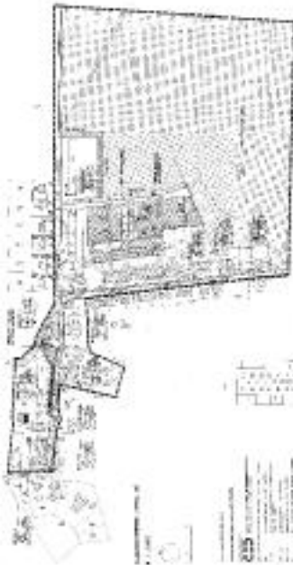
FIGURE 1 SITE PLAN